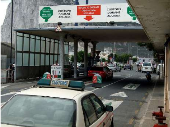
■ Resources were pushed towards preparing for a 'no deal' Brexit

► England, Public Health England, eight local resilience forums (multi-agency partnerships made up of representatives from local public services) and six prisons took part in the exercise. However, once again it focussed on influenza. That aside, the lessons it identified for the building of