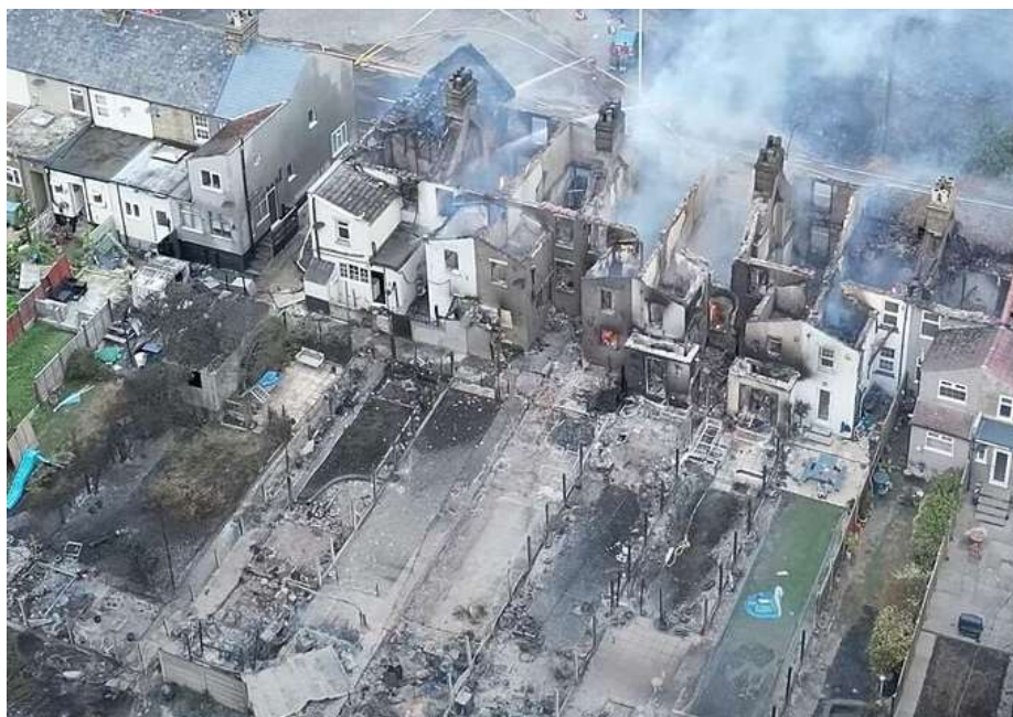
■ The row of houses destroyed in Wellington, during the 2022 heatwave

It also maps London's governance landscape and identifies opportunities for collaboration with key stakeholders and networks. Each section sets out the Borough teams and service areas affected.