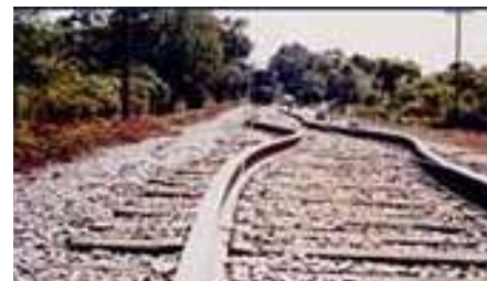
■ Heatwaves can cause railway lines to buckle, causing transport chaos

The guide says: "Climate adaptation and resilience is a growing priority for London Boroughs as average temperatures increase