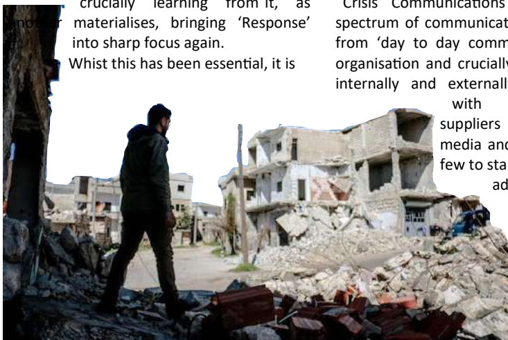
■ Pictures: the world has seen the greatest impacts since World War II - not only the pandemic, but also the conflicts in Ukraine and Palestine

The Crisis Communication Checklist will help organisations consider what they need to have in place and have a plan in place to deal with issues.