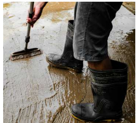
■ Where's your wellies, Minister?

Don't forget the Ministerial team may number up to five, so they will need transporting to the site too. If it's a flood, are there enough high-axle vehicles to get everyone there? I've been with a Secretary of State for the Environment in flooded Evesham, where there was only room for him. Once again, check with the Ministerial