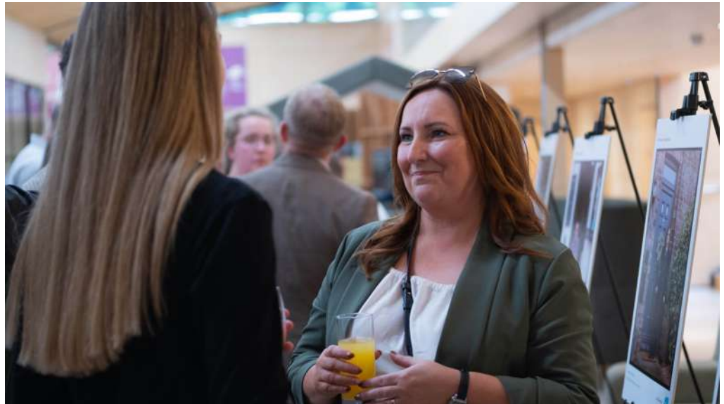
■ The exhibition in full swing - blending culture and business to drive climate resilience

To bring people along on a sometimes difficult journey, we need to appeal to both the head and the heart, the rational and the emotional.