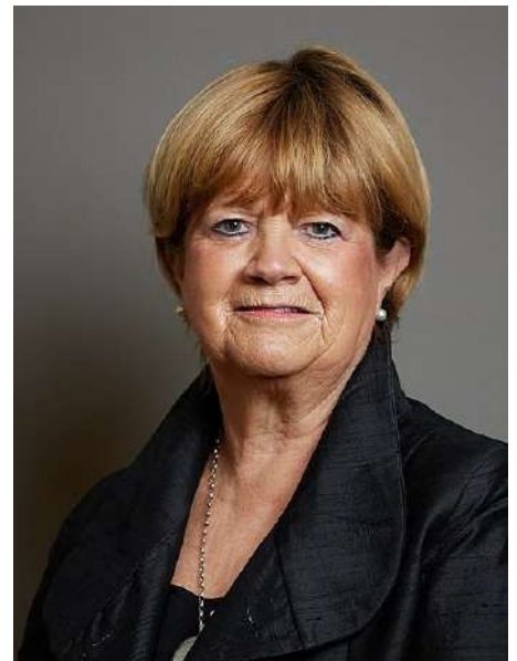
■ The Rt Hon Baroness Hallett DBE, Chair of the UK Covid-19 Inquiry

The evidence is overwhelmingly to the effect that another pandemic – potentially one that is even more transmissible and lethal – is likely to occur in the near to medium future. Unless the lessons are learned, and fundamental change is implemented, that effort and cost will have been in vain when it comes to the next pandemic. There must be radical reform. Never again can a disease be allowed to lead to so many deaths and so much suffering.